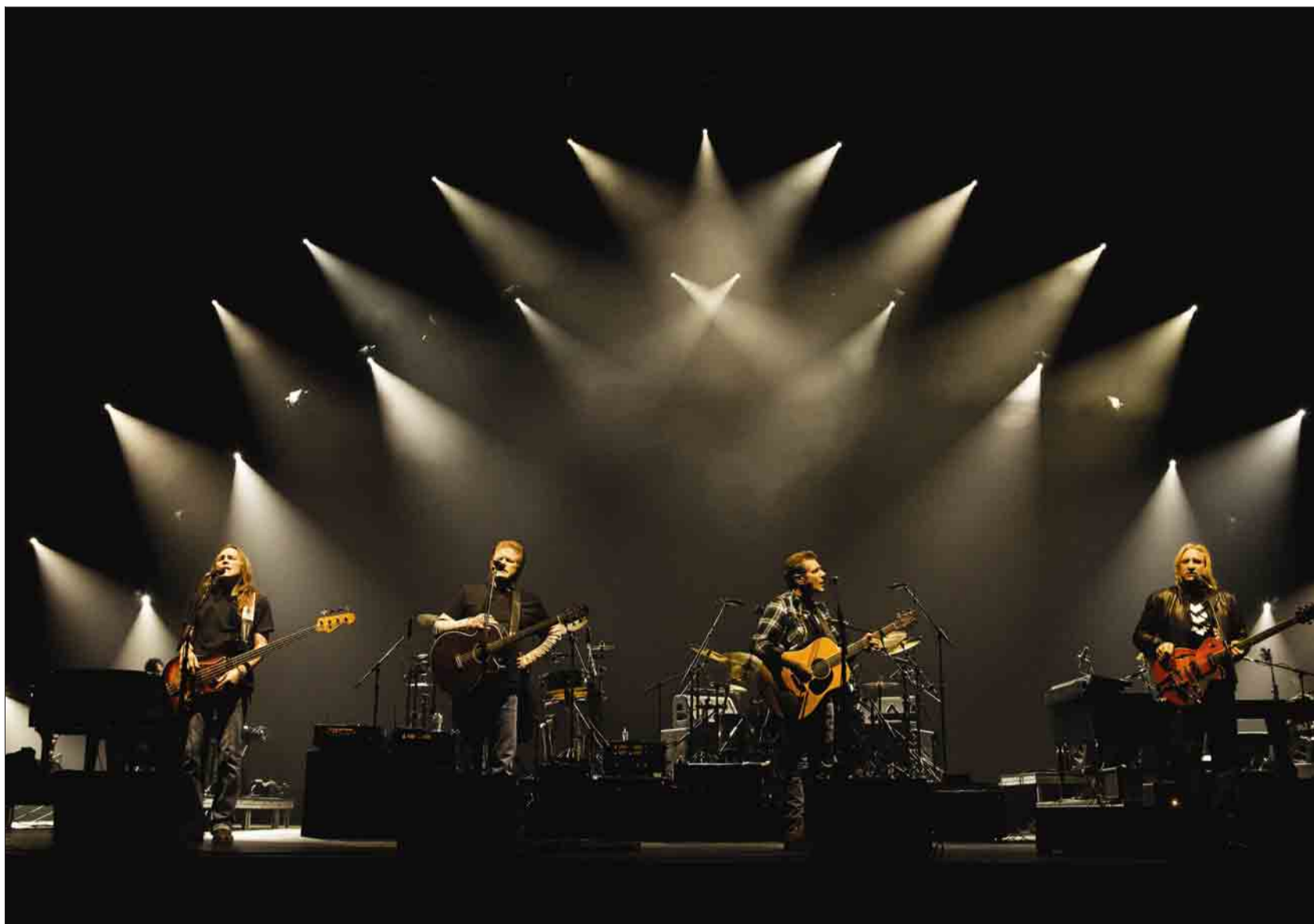
The Eagles will be celebrating their 40th anniversary by the time of their performance in Hong Kong in March where they will feature material from their first studio album in 28 years.

On tracks How Long and Busy Being Fabulous they conjure up the freewheeling sounds of yesteryear, while reminding a new generation of fans why they mattered in the first place.