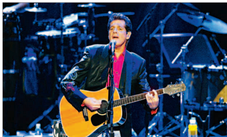
Glenn Frey performs at the Coliseum during the 2004 appearance.