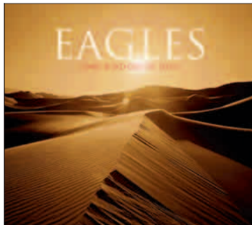
The Eagle's first studio album in 28 years, Long Road Out of Eden

By the time they arrive, the Eagles will be celebrating their 40th anniversary. When they formed in 1971, the burgeoning country-rock scene, that included Neil Young, Linda Ronstadt and the Flying Burrito Brothers, was just lifting off. Their debut, released the following year, produced the top-10 hits Take It Easy , co-written by Jackson Browne, and Witchy Woman . From there the hits came fast and plenty: Peaceful Easy Feeling , Tequila Sunrise , Desperado , The Best of My Love , Lyn' Eyes , One Of These Nights , Take It To The Limit , Hotel California , New Kid In Town , Heartache Tonight and, most recently, 2007's How Long from their first studio album in 28 years, Long Road Out Of Eden . Their influence on mainstream pop has been huge with contemporary stars such as Taylor Swift and Keith Urban direct inheritors of their legacy.